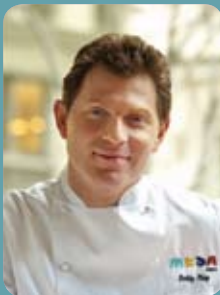
2008 Grand Marshal Bobby Flay

The Kentucky Derby Festival was first held in 1956 on a modest budget of just $640. The festival's very first event was the Pegasus Parade, which marched down Broadway before a crowd of 125,000. Since that time, the Derby Festival has grown by leaps and bounds. Featuring floats, inflatable characters, marching bands, equestrian units and assorted celebrities, the Pegasus Parade has thrilled Louisvillians and their guests for more than half a century. Held every year on the Thursday before the running of the Kentucky Derby, the Pegasus Parade is ranked among the top 15 parades in the country by the International Festivals and Events Association. The parade is not only the Derby Festival's oldest event, but also its most beloved. Capping off the two-week-long Kentucky Derby Festival, the Pegasus Parade showcases some of the most spectacular attractions to be found anywhere. It's a tradition that just keeps getting better every year.