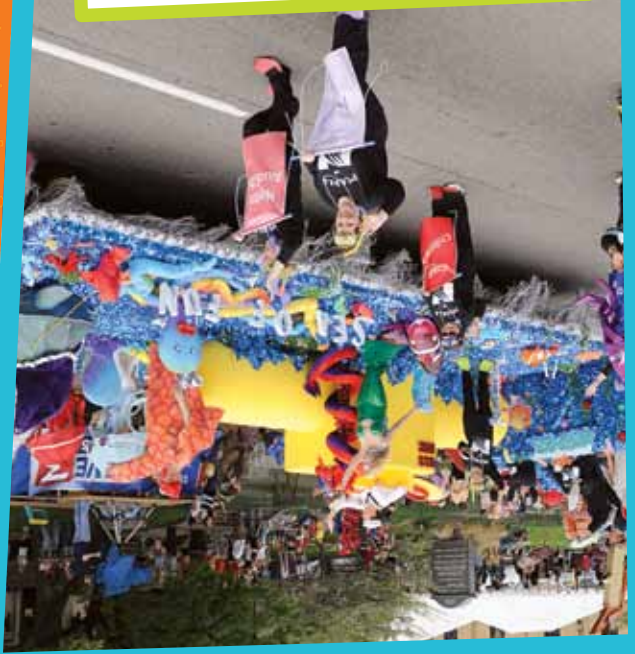
Norton Healthcare 2009 Sweepstakes Winner

Since the parade's inception, elaborate floats have been a mainstay of the annual event. Float units take part in a friendly competition for awards from parade judges, making the countless hours of preparation well worthwhile. Both the inflatables and floats are displayed before the thousands of fans at the Parade Preview Party held two days before the Pegasus Parade. To enter a float, call 502-584-FEST.