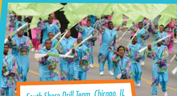
South Shore Drill Team, Chicago, IL