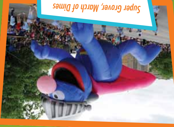
Super Grover, March of Dimes

Among the most popular units in the Pegasus Parade are the giant inflatable characters which float down the route to the delight of children ages two to 92. The colorful inflatables are larger than life and elicit squeals of joy from spectators lined up for more than a mile. There is a costume contest for handlers of inflatables for best theme and best dressed handlers. For more information, call 502-584-FEST.