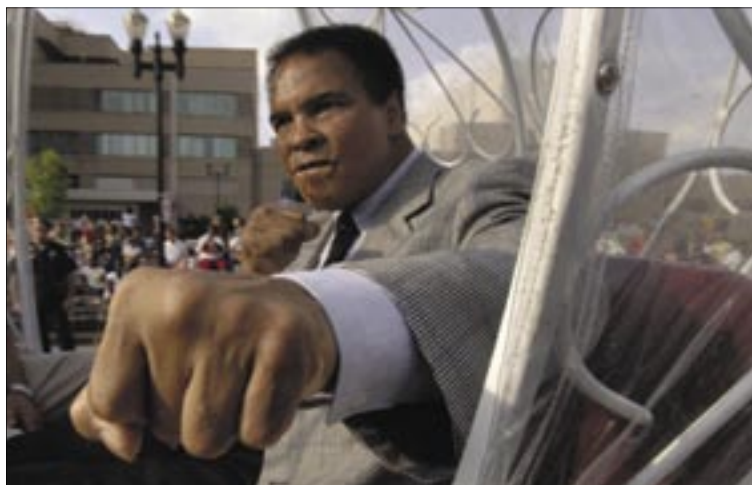
Parade Grand Marshal Muhammad Ali shadowboxed with the crowd.